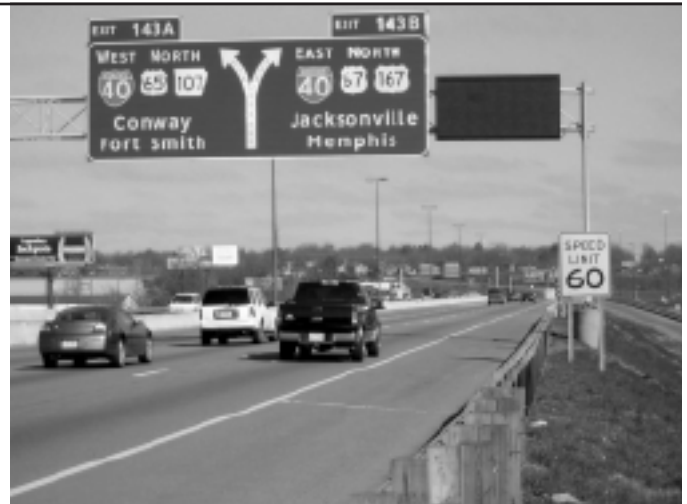
Traffic passes underneath a new message board on Interstate 30 in North Little Rock.

CSEPP also works closely with seven other sites in the United States where chemical stockpiles are stored.