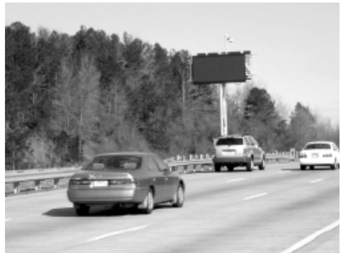
This new message board on Interstate 430 in Little Rock is one of numerous boards being constructed in Central Arkansas.