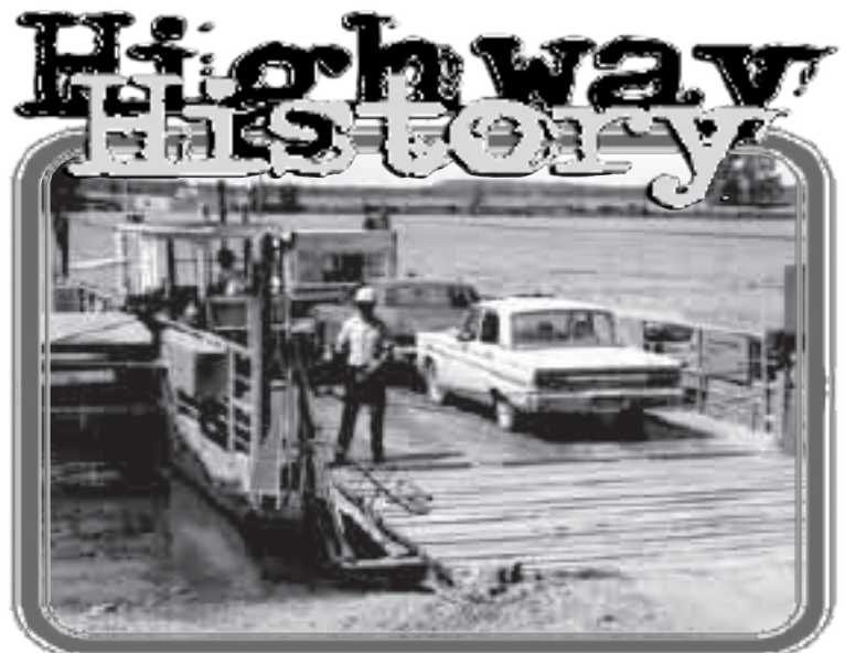
The Toad Suck Ferry on the Arkansas River at Highway 60 in 1970. Only one ferry remains in Arkansas, the Peel Ferry in Marion County crossing Bull Shoals Lake.